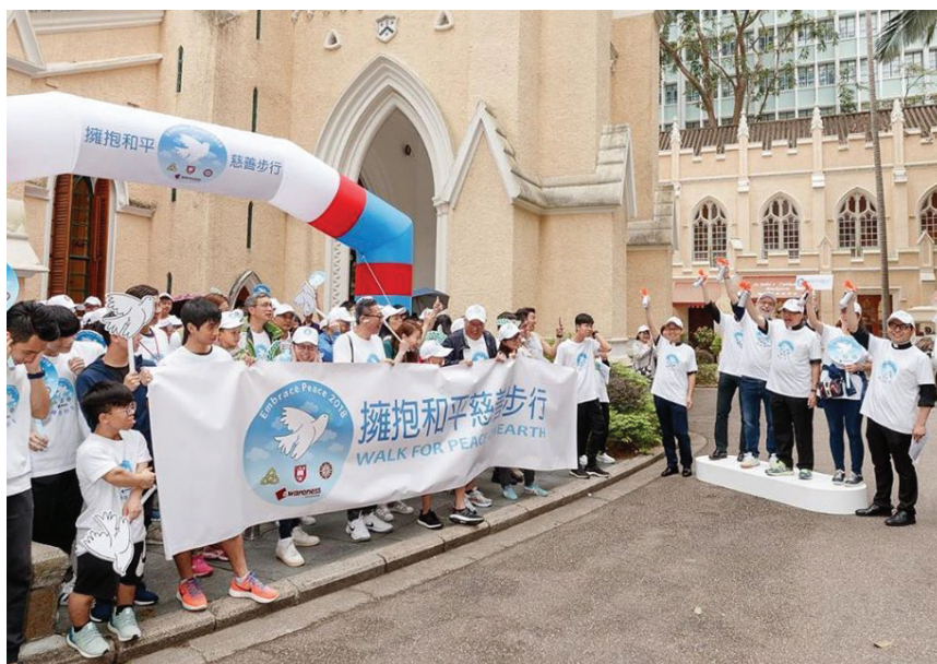
The starting point for the Walk for Peace on Earth