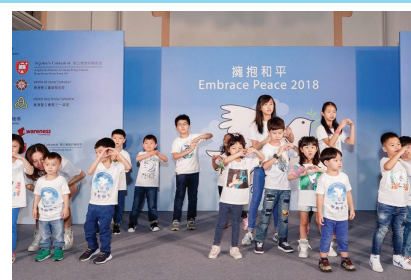
The Fashion Show with the winning T-shirt designs