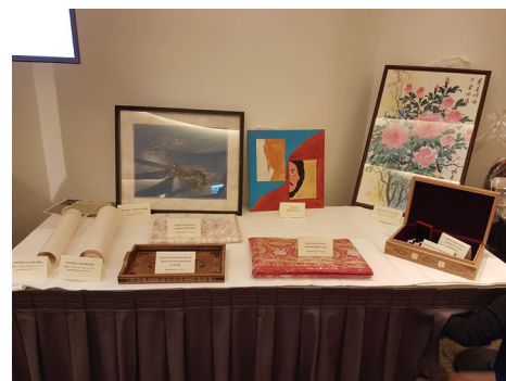
The silent auction lots