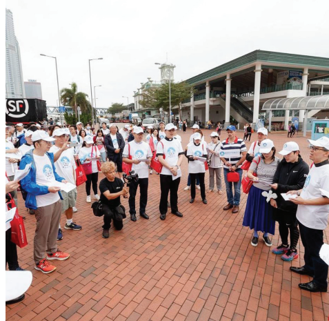
Singing and praying