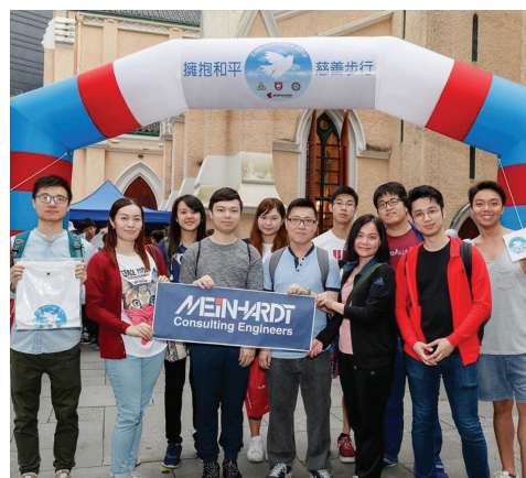
Walkers from Meinhardt, another of the event's sponsors