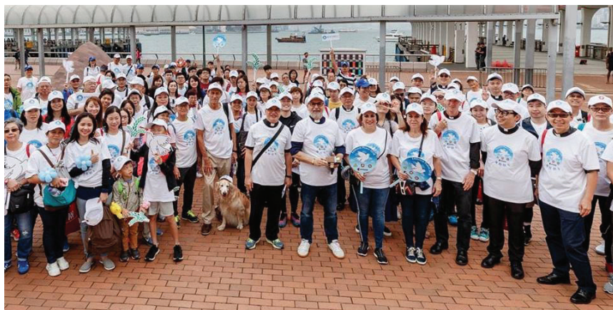
The first to reach the halfway point at Victoria Harbour!

We look forward to returning in 2019 to Walk for Peace on Earth at the start of the next Embrace Peace Day.