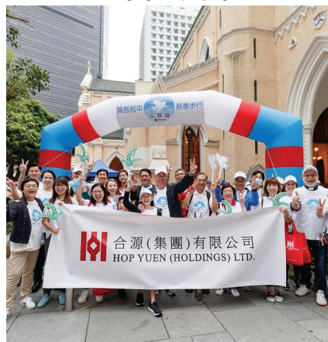
A group of walkers from Hop Yuen (Holdings) Ltd, one of the event's sponsors