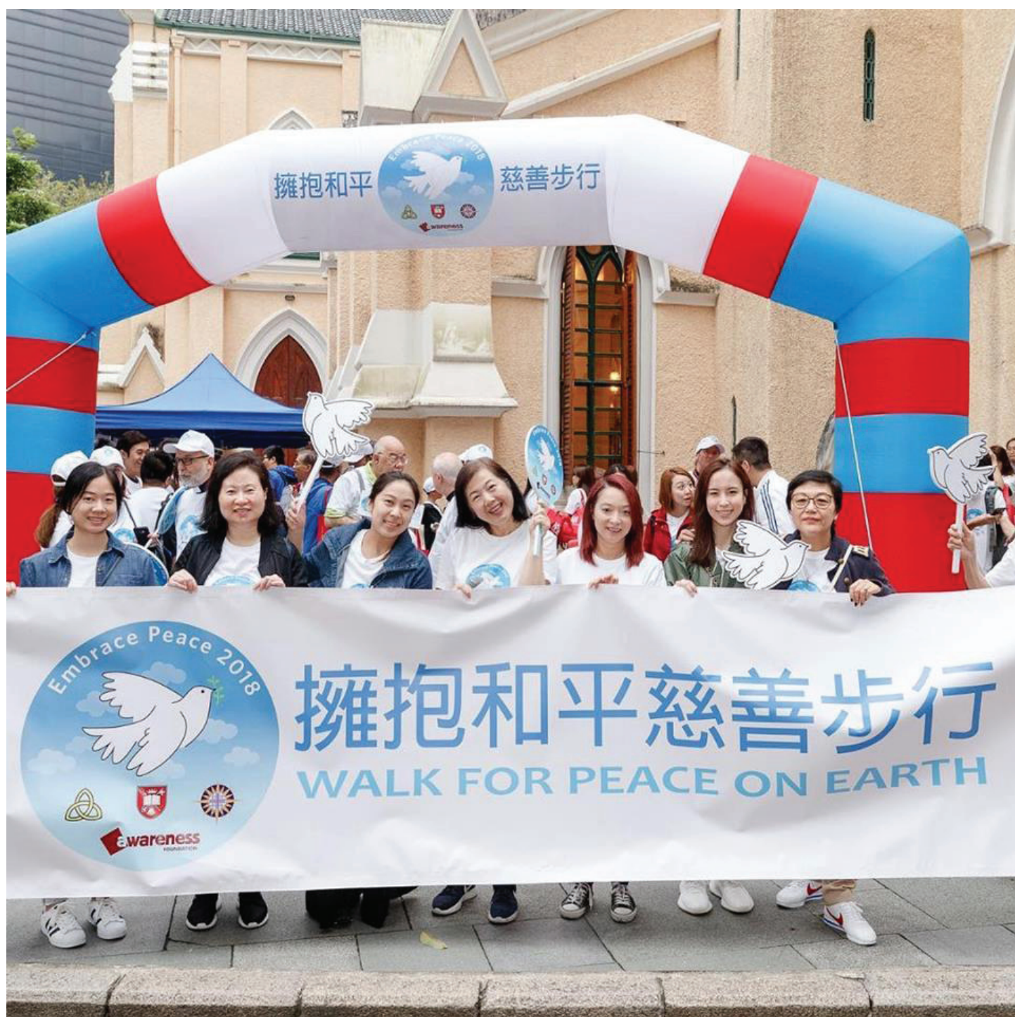
Embrace Peace Day, Hong Kong 2018