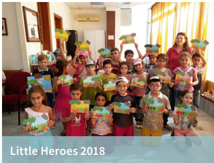
Little Heroes 2018

The war continues to rage in Syria and Iraq, and we still have hope: hope in our future, hope to challenge the world to turn its back on warfare and violence, hope that the children and young people can make peace.