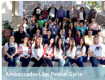
Ambassadors for Peace: Syria

Jul/Oct Empowering young Syrians to become Ambassadors for Peace