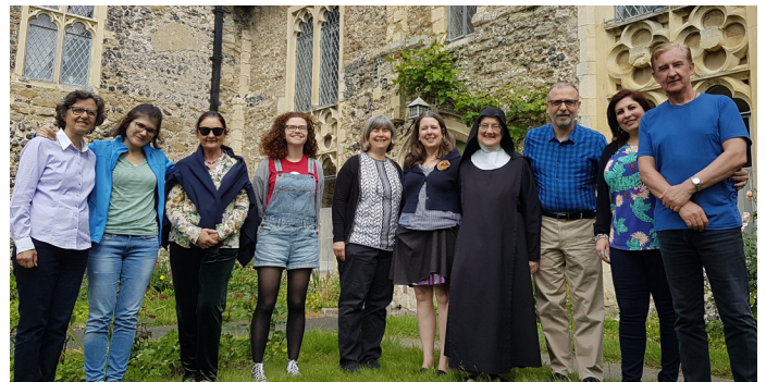
Staff, volunteers and supporters of the Awareness Foundation gathered together in June 2018 for a special retreat at Minster Abbey in Kent.

"But Jesus often withdrew to lonely places and prayed." (Luke 5:16)