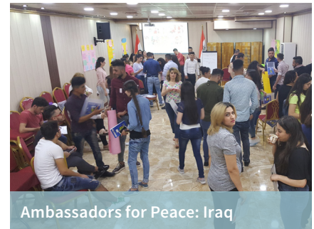
Ambassadors for Peace: Iraq

The 35 Project Managers will complete their training this year, enabling them to launch their peace-building projects into their communities. This is the culmination of a programme begun in 2014 to enable young people to become peace-makers and reconcilers in society.