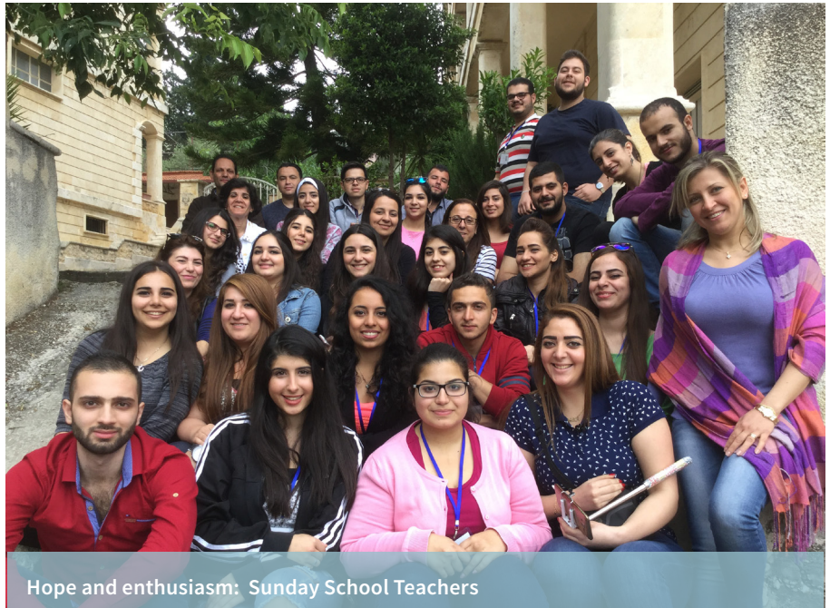
Hope and enthusiasm: Sunday School Teachers